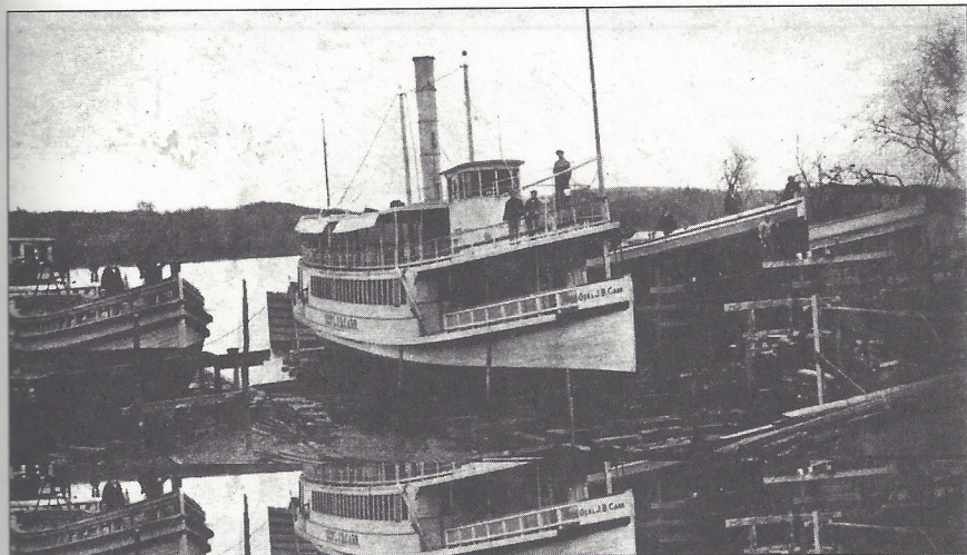
The Gen. J.B. Carr being worked on at a New Baltimore shipyard with a tugboat hull next to it on the left. The J.B. Carr served as a passenger ferry between Albany and Troy. She had been built at Rondout as the Priam in 1892.

eventually came under the ownership of Rondout-based Cornell Steamboat Company, as did a number of other Athens-built vessels, such as Thomas Chubb of 1888, H. D. Mould of 1896, P. McCabe, Jr. (renamed W. B. McCulloch ) of 1899, and Primrose of 1902.