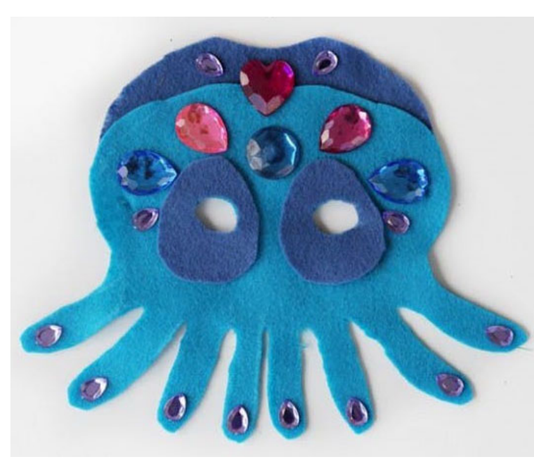
Make a sea monster mask like this one!

Join the Hudson River Maritime Museum as we participate in the 31st Annual Kingston St. Patrick's Day Parade, Sunday, March 11 at 1 p.m. We want you and your family to be part of our float!