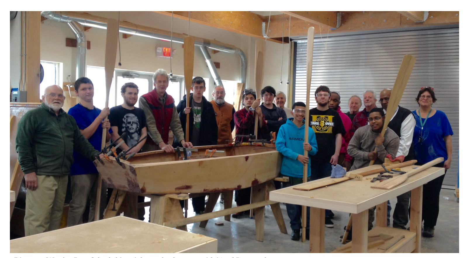
Riverport Wooden Boat School shipwrights and volunteers with YouthBoat students.

There is no cost for YouthBoat participants, but we need your support to keep our doors open. Please visit Crowdwise at <a href="https://www.crowdrise.com/support-youthboat">https://www.crowdrise.com/support-youthboat</a> to learn more about our fund raising campaign. Watch the video and share it on Facebook, Twitter or other social media sites.